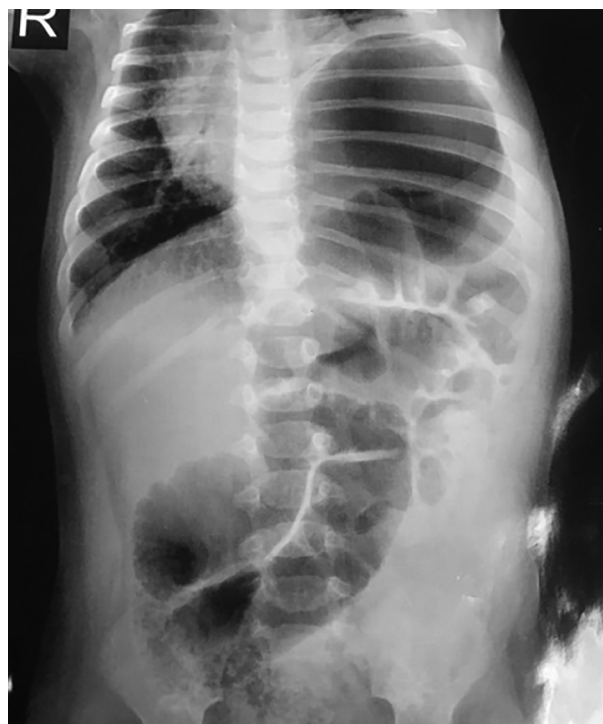
Figure 1. Recurrent CDH

This is due to the hypo-plastic lungs of the neonate cannot, effectively excrete CO 2 , during the CDH repair (12). Additionally, gas insufflation results in raised intra-cavity pressure and the risk of barotrauma (13). CDH surgical repair is still challenging conditions, which are performed traditionally or by MIS. Each approach has some advantages and disadvantages. While open surgery is associated with musculoskeletal deformities in future, physiological, and respiratory complications; MIS provides less risk of adhesions but higher risk of recurrence, longer operation time, and difficult visualization (14). Lansdale et al., 2010, in a meta-analysis reported that MIS methods had greater risk of re-herniation (12). Considering suturing in a limited space of the neonate hemi thorax, restricted movements of native diaphragmatic tissue and less substantial tissue involved in suture and patches, recurrence following this surgical method could be anticipated (9). In an-