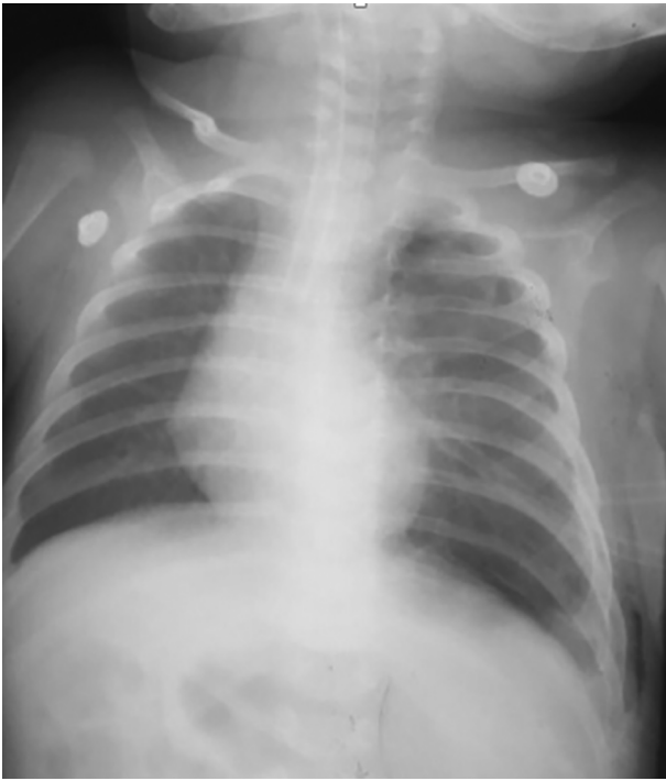
Figure 3. Repaired diaphragmatic hernia

and experience are important (16). In a cohort study conducted by Putnam et al. (17), a total of 3332 neonates with the history of CDH repair were followed up. They reported that 2.3% of the cases with the median age of 78 (28 - 112) days experienced recurrence and MIS methods, larger defect, liver herniation, and extracorporeal membrane oxygenation (ECMO) were associated with the higher risk of re-herniation (17). In these cases anesthesiologists are also faced by a number of difficulties such as pulmonary hypoplasia, complications of mask ventilation due to the fear of high volumes, and the proper decision for extubation (1). Furthermore, parents should be well informed about the risks and benefits of two surgical methods. In this case, the surgeon had discharged the neonate in a healthy status and had tried to eliminate all parents' fear and anxieties, thus, when his conditions were changed and even when he deteriorated more and more, they did not feel that informing the doctors from the mentioned operation might be so crucial. Obviously poor physical exam and medical history obtaining could not be ignored. The whole re-herniation status requires an early diagnosis and urgent intervention. To achieve the goal, informing the parents clearly about the potential risks of recurrence after a successful surgical repair and even a complete healthy status is vital. Spending enough time for the patient performing an exact physical