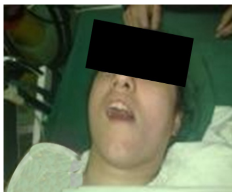
Figure 1. TMJ dislocation

Temporomandibular joint (TMJ) instability, while not always symptomatic, has a prevalence of up to 25–50% in the general population, and is most common in middle aged females. (1,2) Such instability may have important implications for airway management during anesthesia. Temporomandibular joint dislocation occurs when the condyle is displaced anterior to the auricular eminence and the patient unable to reduce itself back into the glenoid fossa. (3-6)