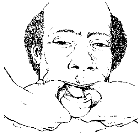
Figure4. technique of reduction of jaw dislocation